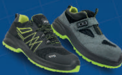
STEEL AND COMPOSITE TOE CAPS SAFETY FOOTWEARS