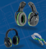
EARPLUG AND EARMUFF HEARING PROTECTORS