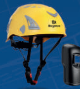
HEAD AND FACE PROTECTION FACESHIELD AND HELMETS