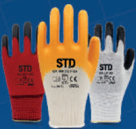
IN OCCUPATIONAL SAFETY STANDARDS SAFETY GLOVES