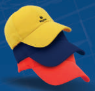
HEAD PROTECTION BUMPCAP