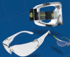
ANTI-FOG AND SCRATCH-RESISTANT SAFETY GLASSES